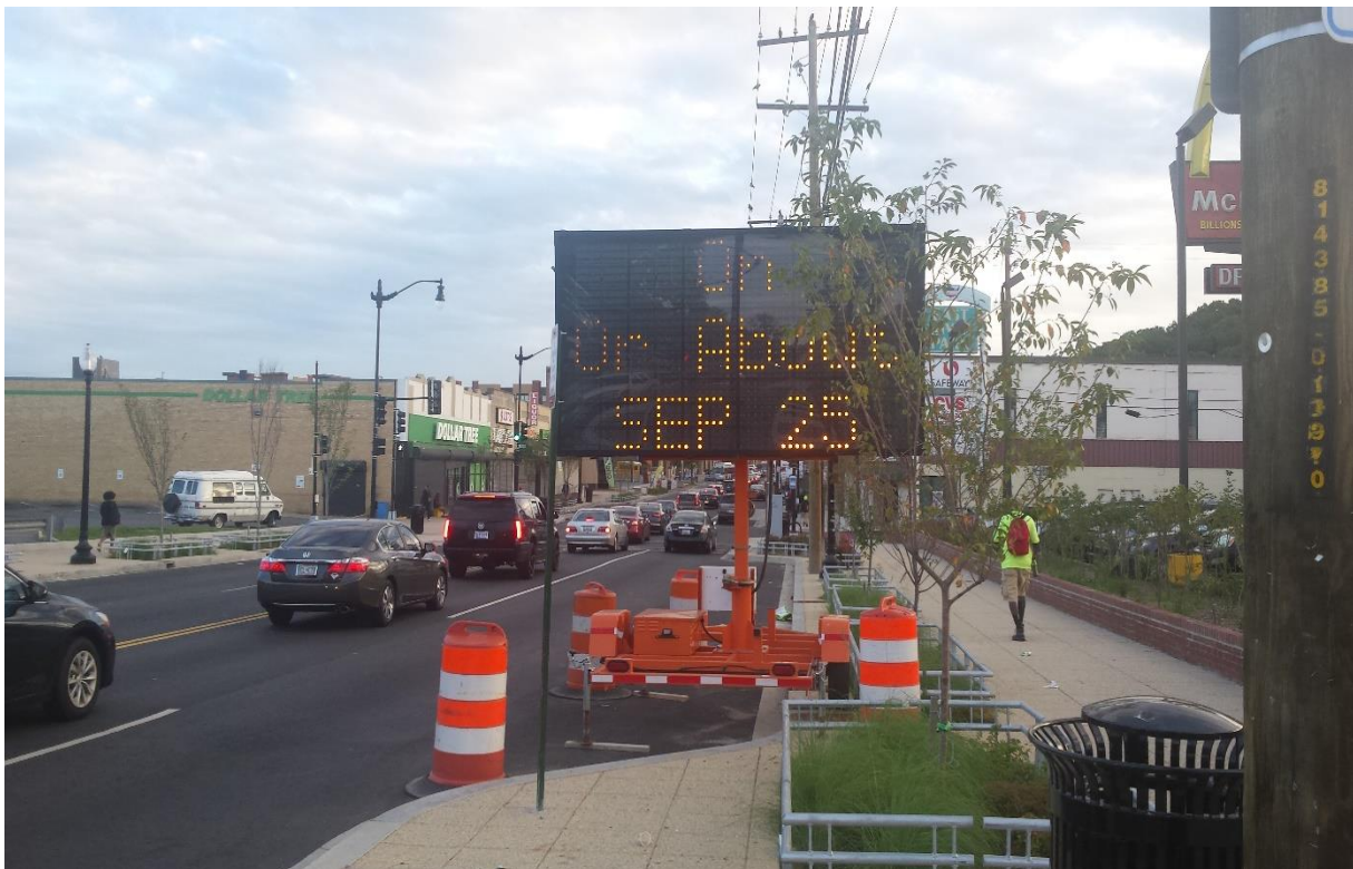
Figure 1 Project VMS Board at Dix Street/Minnesota Avenue NE