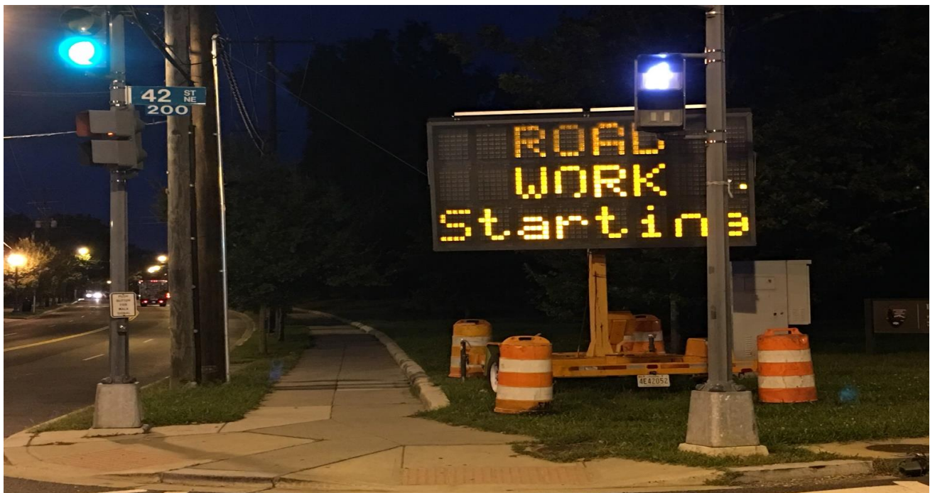
• Figure 4 Through project limit at night to ensure VMS Board are working.